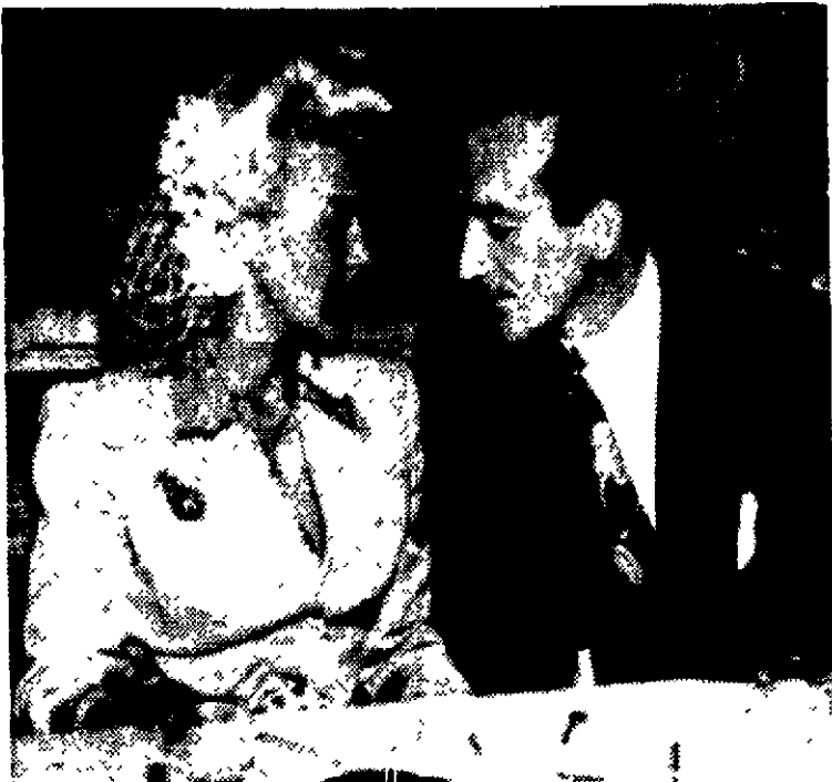
SHE'LL WED BAND LEADER —Betty Grable, motion picture actress, announced she will marry Harry James, band leader, in Las Vegas, Nev., next Monday (July 5). The couple is shown at a New York night club.